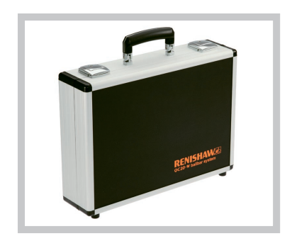
QC20-W system case