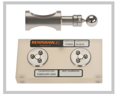
QC20-W small circle accessory kit