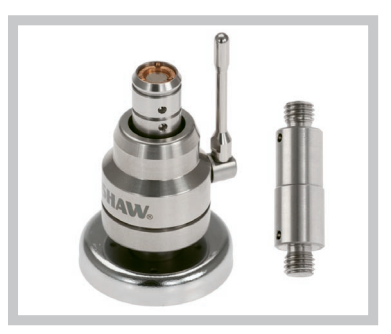
QC20-W partial arc kit