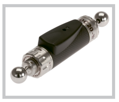
QC20-W basic upgrade kit

The Bluetooth word mark and logos are owned by Bluetooth SIG, Inc. and any use of such marks by Renishaw plc is under license. Other trademarks and trade names are those of their respective owners.