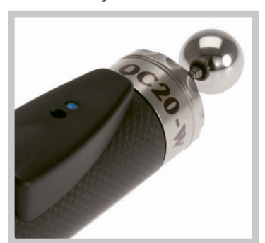
Bluetooth wireless technology

Wireless communications: Bluetooth® wireless technology ensures quicker set up and an extended operating range over the cabled interface of QC10. No wires means that enclosure doors can stay shut during testing, an added safety feature.