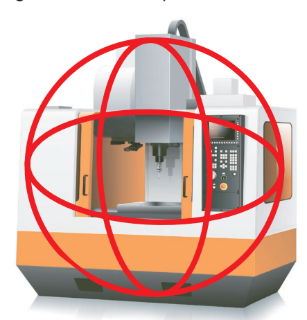
Perfect circles in X, Y and Z axis define a perfect machine

In theory if a CNC machine's positioning performance was perfect then the circle traced out by the machine would exactly match the programmed circular path.